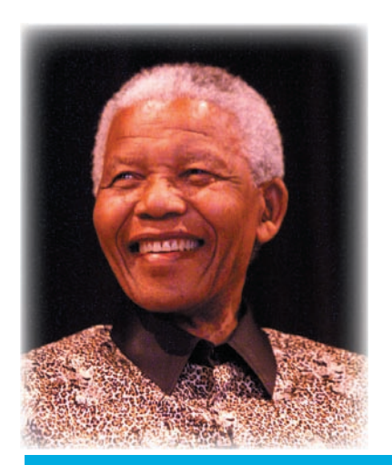
Inspirational Quotes: Nelson Mandela

The SAHRC joins and applaud Government and Business employees who will participate in good deeds with many charities on Mandela Day. Government, and the Businesses it contracts, must use their power and resources, to deepen the realization of human rights as a Constitutional imperative. 'Make everyday a Mandela Day.' The Mandela Day activities should be linked to ensuring that the core work of creating employment and building schools, hospitals, clinics, homes, food, communities and our country, is done in