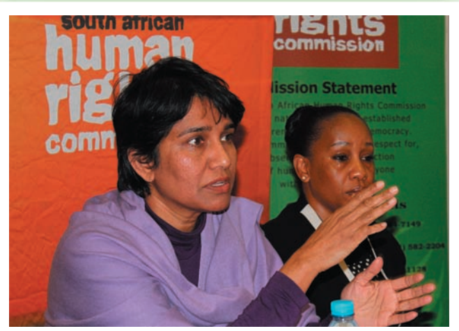
Deputy Chair, Pregs Govender launching the findings report on Water and Sanitation in Bloemfontein

The South African Human Rights Commission launched the water and sanitation findings report against four Free State Municipalities; Mangaung Metropolitan, Setsoto, Dihlabeng, and Masilonyana. The findings relate to complaints lodged with the Commission over lack of sanitation in the respective areas.